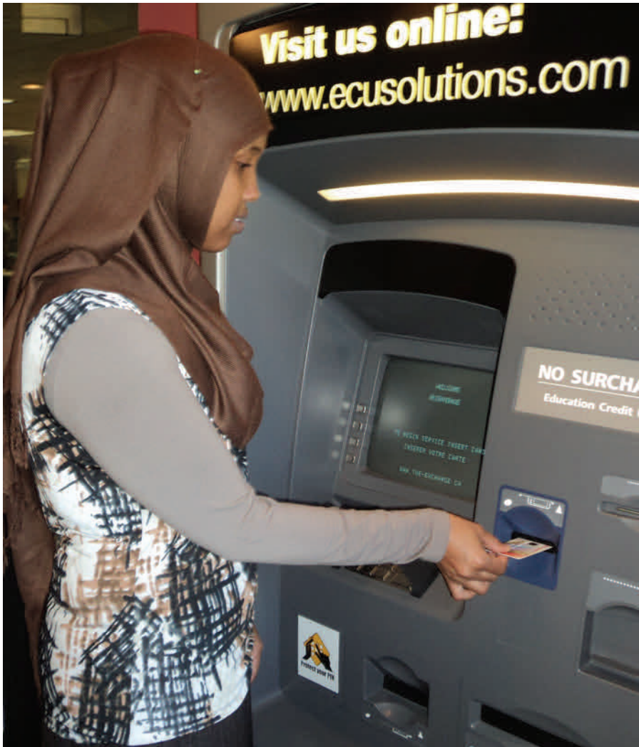
ATM Automated Teller Machine